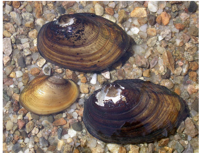
Two adult and one juvenile tidewater mucket from Mystic Lake.

In the summer of 2009, landowners around Mystic Lake began to see an unusually large number of mussels dying and washing ashore. This die-off began in early August and quickly escalated, reaching a peak by mid-month. The event was preceded by an unusually wet period during June and July. This was followed by particularly warm air temperatures and a rapid increase in algal turbidity in the lake. The